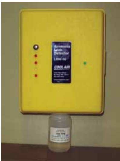
Test bottle placement for the LBW-50.

We recommend testing not calibrating your ammonia leak detector once every month using the ammonia test bottle. For your convenience, there are numbers to check off on the ammonia test bottle for each month of testing. After one year, purchase a new ammonia test bottle, follow the calibration procedure above, and then use the same bottle for testing your ammonia leak detector throughout the year.