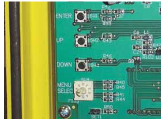
Adjustment switch/buttons and jumper for the LBW-420.