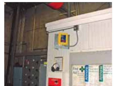
Ammonia leak detector installed in an engine room.

- Clarence the Angel to George Baily in "It's A Wonderful Life"