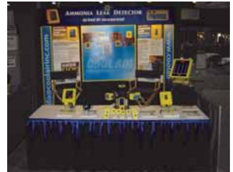
Cool Air Incorporated convention booth

International Association of Refrigerated Warehouses (IARW-WFLO-IRTA) April 19–24, 2008 Marco Island Marriott Beach Resort, Golf Club, & Spa Marco Island, FL USA