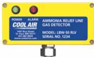
LBW-50-RLV relief line ammonia leak detector