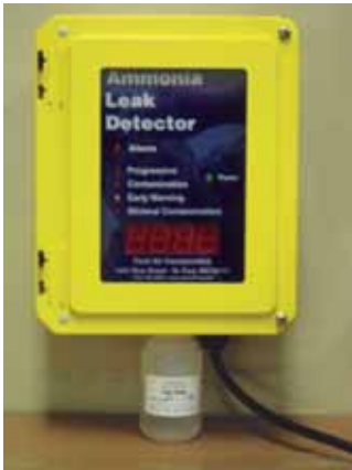
Test bottle placement for the LBW-420.