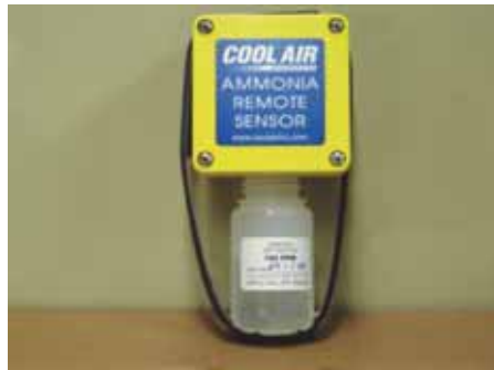
Test bottle placement for the LBW-420 remote sensor.